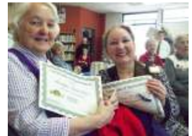
The Best Supporters Ever